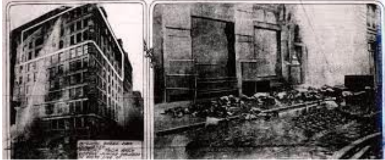
154 KILLED IN SKYSCRAPER FACTORY FIRE; SCORES BURN, OTHERS LEAP TO DEATH.